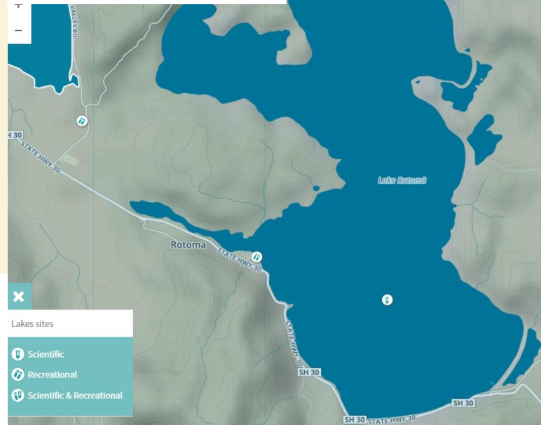
Monitoring Sites