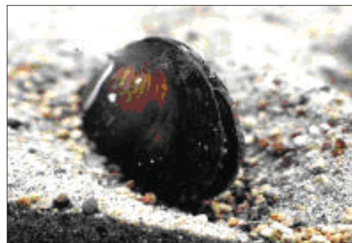
Kakahi or freshwater mussel.