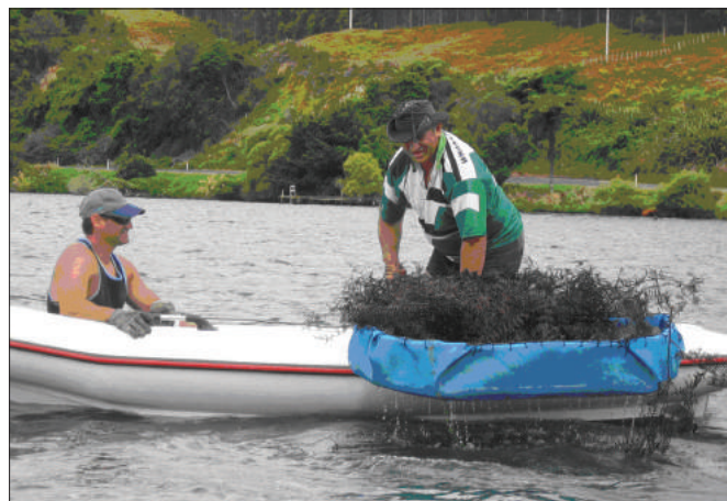
Harvesting koura using the traditional tau koura method.

Established United States Environmental Protection Agency (US EPA) procedures were followed to assess the risk to people's health from eating chemically contaminated wild kai over their lifetimes. This assessment was based on using Te Arawa data on meal size and weekly consumption and measuring chemical contaminants in wild kai sampled from