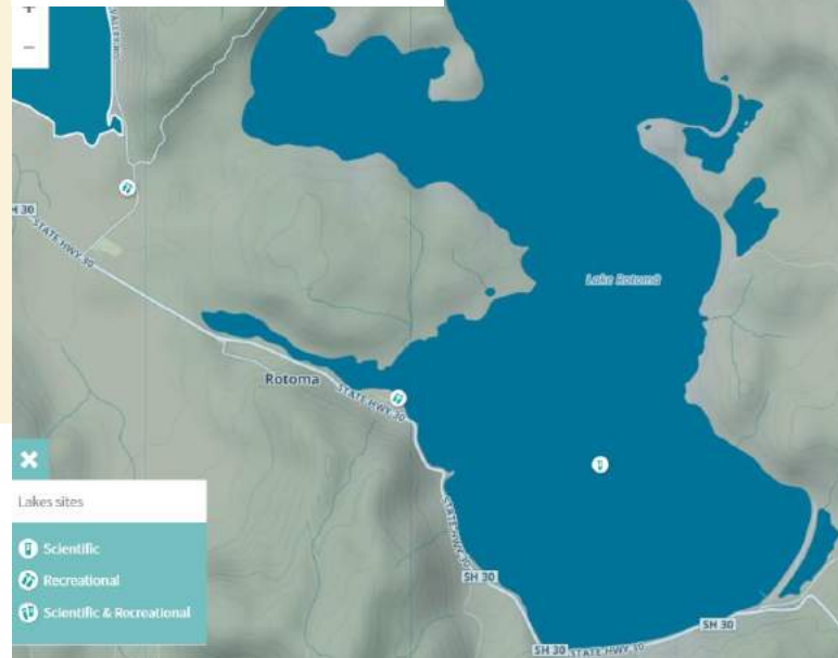
Monitoring Sites